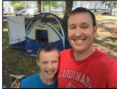
We went on a camping trip for my Passport2Purity weekend. We forgot the sleeping bags, but thankfully we remembered the air mattress.