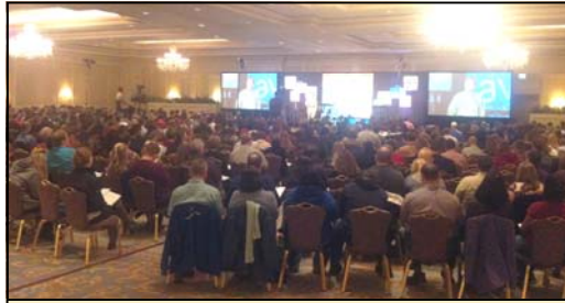
Over 600 people attended the St. Louis Weekend to Remember last weekend

“We were on the verge of divorce after 16 years and had to do something. We have 5 kids and we want them to grow up with both parents in the home. This Weekend To Remember has given me hope for my marriage! Weekend To Remember has given us tools to use to make our marriage stronger!” St. Louis attendee. (You can read more comments from attendees on the back page.)